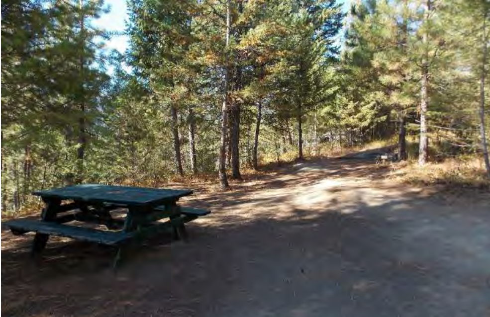
Group Area A