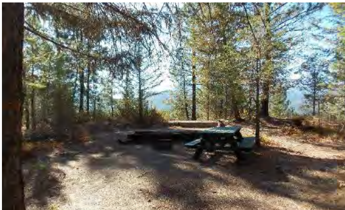
Group Area B

*Shared = Services shared with persons occupying other group tent site (A or B)