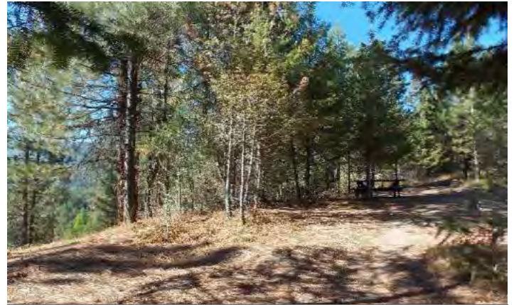
Group Area B looking towards Group Area A