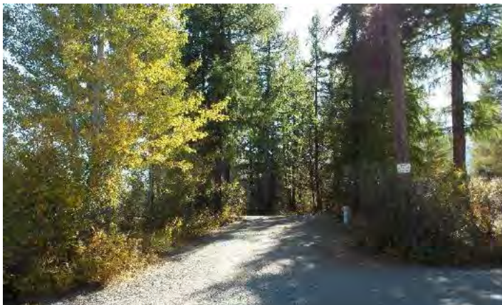
Group Area A & B - Shared Parking and Utilities