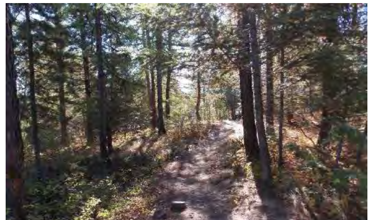
Path leading from parking to Group Area A & B